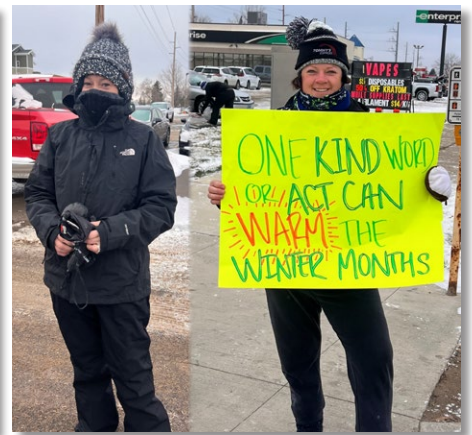
DCIL staff "Freezin' for a Reason" to bring awareness to hunger and homelessness in Bismarck.

Donations of new or gently used coats, boots, scarves,