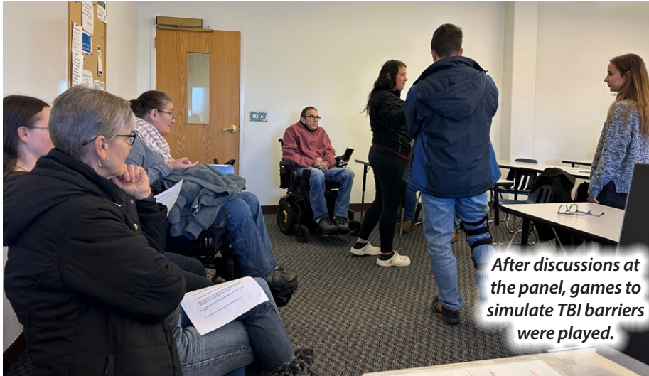
After discussions at the panel, games to simulate TBI barriers were played.

There are hopes to expand the panel in the future with more participants who have disabilities to share their stories and participate in Q & A.