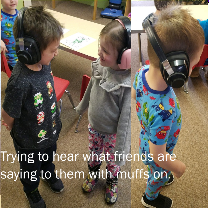
Trying to hear what friends are saying to them with muffs on.