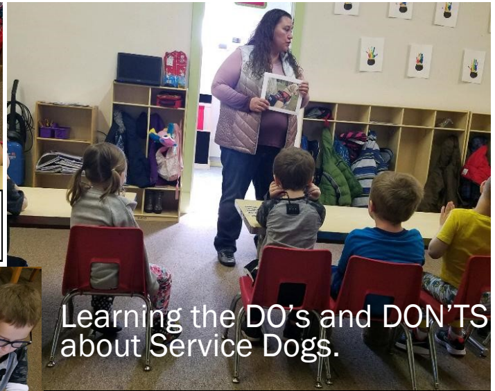
Learning the DO's and DON'TS about Service Dogs.