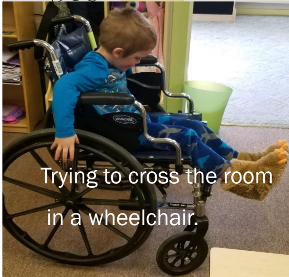
Trying to cross the room in a wheelchair.