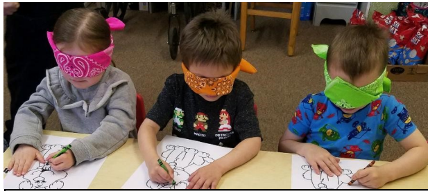
Trying to color the dogs nose being blind folded.