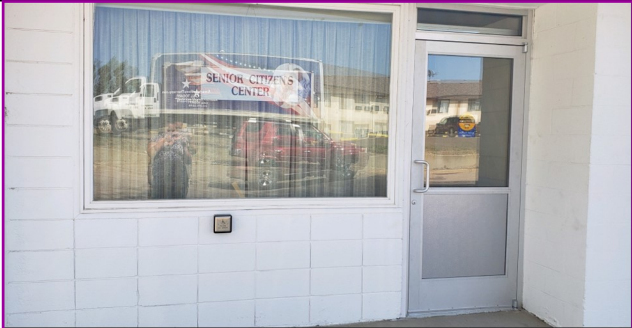
With mill levy money, The Bowman Senior Citizens Center put in a new automatic accessible door.